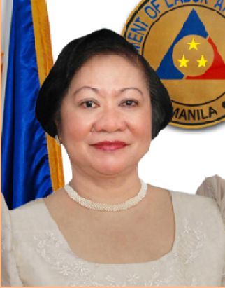
ROSALINDA DIMAPILIS-BALDOZ Secretary of Labor and Employment Chairperson