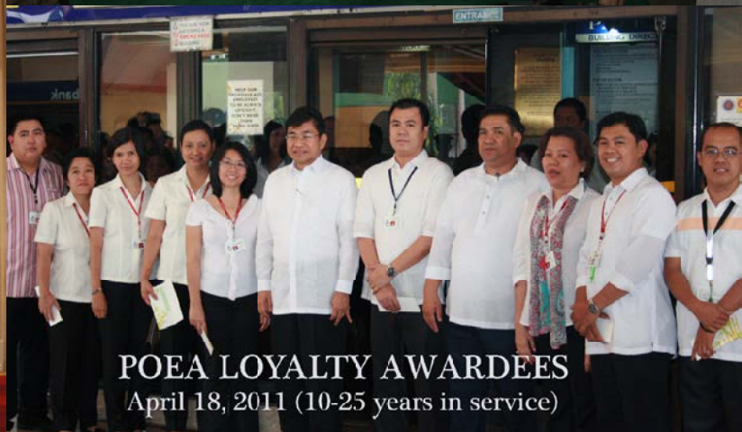
POEA LOYALTY AWARDEES April 18, 2011 (10-25 years in service)